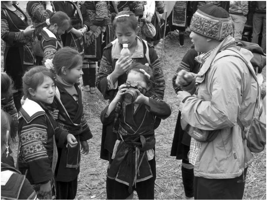
Hmong child playing with camera of tourist

The following case study is about homestay tourism and its impacts on local villagers. It presents a critical review of pro-poor tourism programs implemented in Sapa, the northwestern former hill station and home to many ethnic groups. Pim Verweij (MA), who did his research in 2013, carried out the fieldwork. In this report, the term “we” is used to refer to the researcher and also to this author, who supervised the study partly in the framework of research on civil society. For obvious reasons, the case study in this context is adapted for a wider audience and fits in with the topic of civil society issues in Vietnam today. Special attention is paid to the VNGOs involved in homestay tourism .