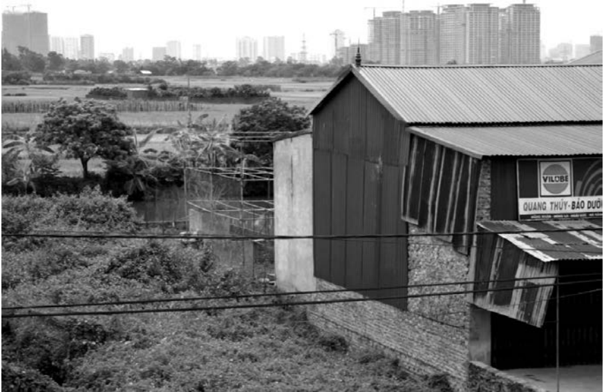
Encroaching cityscapes of Greater Hanoi

including the still omnipresent motorcycles, but also see high-rise buildings and blocks of apartments and compartment houses. Street sides are no longer the location of frantic building activities; also the green rice fields of the past have become landscapes where rapid urbanization has thoroughly changed the area's in-between status as part countryside and part city.