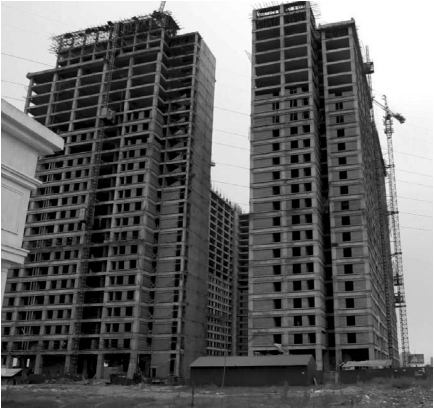
Apartment buildings

In Lang To, the absence of a military chapter brings the representatives from the Party and the mass organizations together. Meetings like this get the description, “emergency meetings”. Whenever the village built, for instance, a road or an irrigation system, about ten non-Party members were involved to supervise the work. It was difficult for contractors to corrupt the contracts.