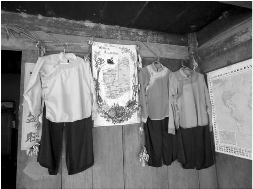
Hmong clothing and tourist poster

First, proponents of pro-poor tourism are not “anti-capitalist”. “Rather, strategies derived from a pro-poor tourism perspective are formulated to incorporate the poor into capitalist markets by increasing benefits, available to them” (Harrison, 2008: 855). In Vietnam, villagers are indeed incorporated into “capitalist markets”, largely in a manner of “increasing competition”. Most villagers working with homestay tourism are not trained to cope with these forms of competition, in particular competing with outsiders, Kinh or foreign, who open businesses in their villages. This causes unrest and conflicts in the villages, especially when the apparent success of homestay tourism attracts new people from outside the village who possess more capital and knowledge than