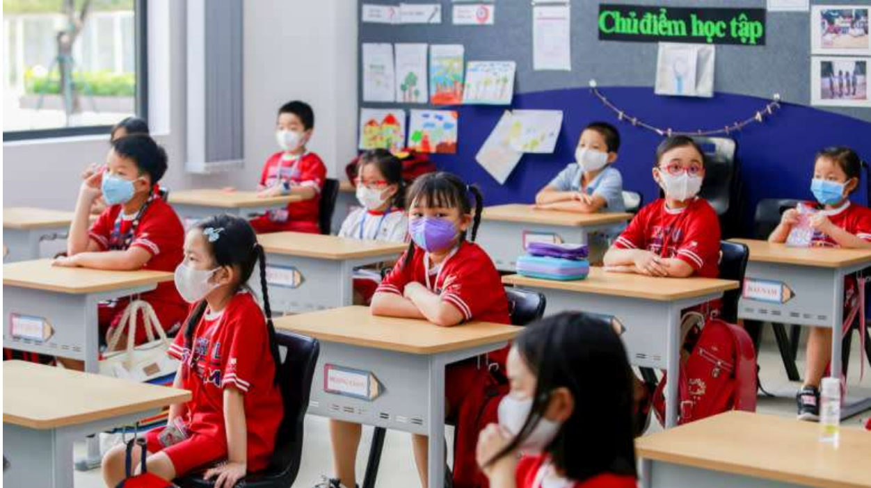
Primary school students wear protective masks on their first day of class after the government eased a nationwide lockdown in May 2020.

Grabbing market share has itself become a national preoccupation. The minimal lockdown meant domestic companies bounced back sooner and gained an edge in the region. More foreigners have singled out the communist country for investment, thanks to the recovered economy and the absence of a real coronavirus resurgence. At the same time, government officials say they will be more discerning in the investors they seek, with a focus on technology transfers that advance Vietnam up the value chain.