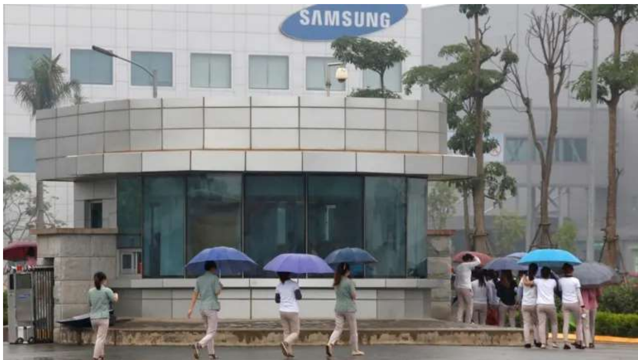
Employees go to work at the Samsung factory in Thai Nguyen province, north of Hanoi on Oct. 13, 2016.

By year's end, nearly all of Apple's major suppliers in the region had set up shop in Vietnam or planned to do so. The relocations continue a "China Plus One" trend among companies that have reduced their reliance on Asia's biggest economy because of rising costs, the risks from a trade war with the U.S., and COVID-19 disruptions to the supply chain.