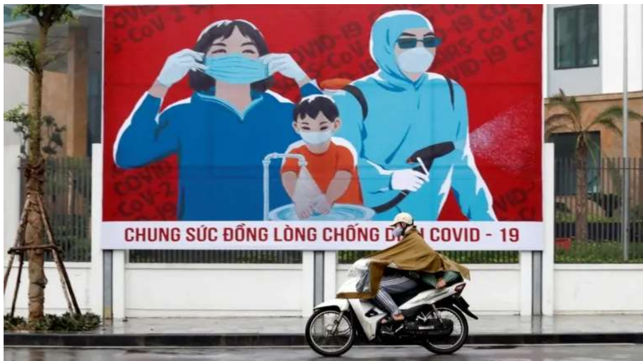
A propaganda banner promotes mask-wearing in Hanoi, April 2020.

Shipments of wood products and furniture totaled $1.05 billion in January 2020, before global lockdowns, but jumped 47% by November when lockdowns were well under way, according to the latest statistics office data. In the same period, exports of phones, computers, and other electronics swelled 56%. For example Samsung, by far the biggest exporter in Vietnam, reported its highest-ever global revenues in the third quarter, worth $61 billion.