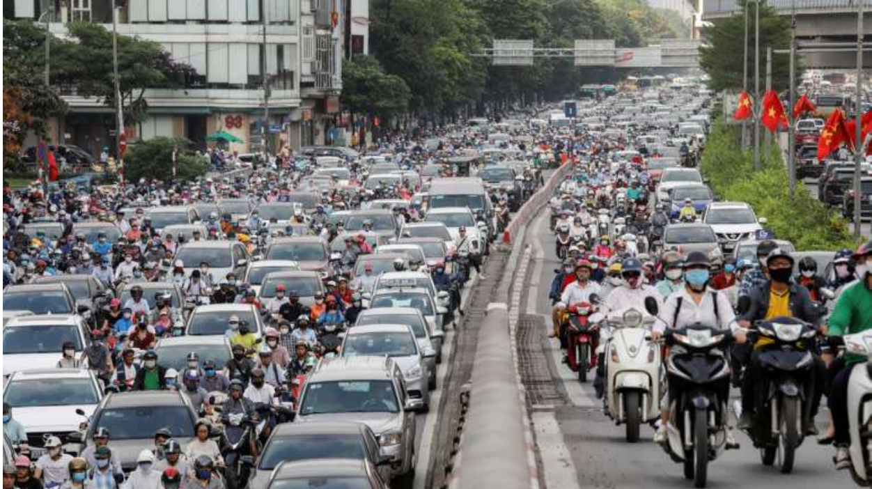
Morning rush hour after the government eased the nationwide lockdown in May 2020.