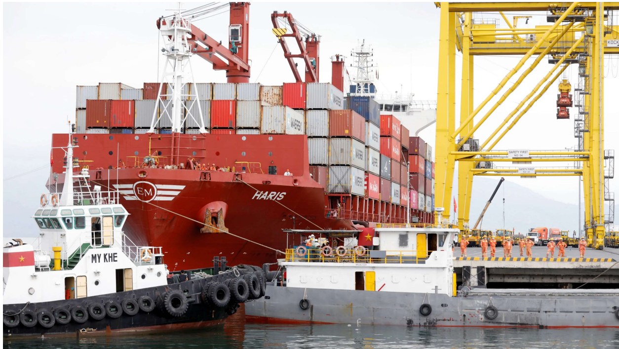
Containers are loaded onto a ship at Tien Sa port in Da Nang city, March 2020.