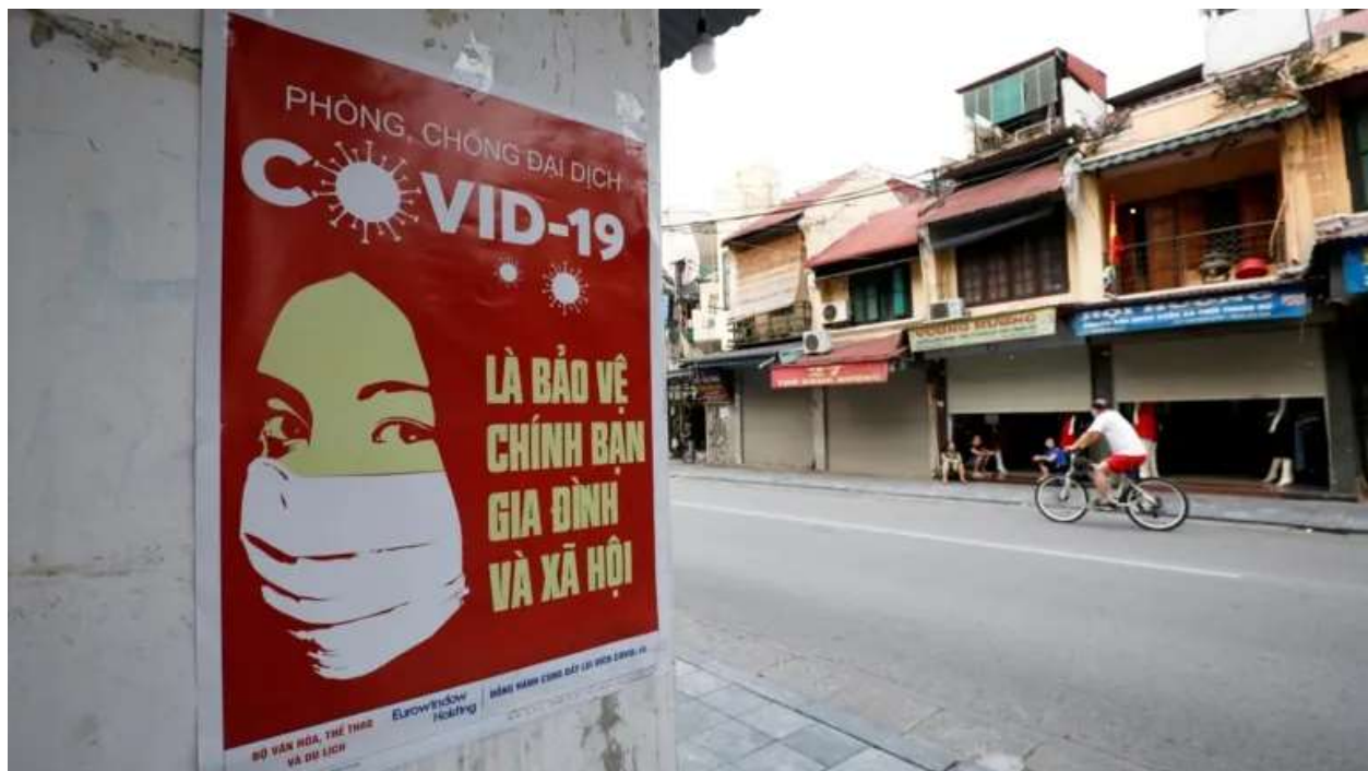
A poster warning about the coronavirus disease in Hanoi, April 2020.