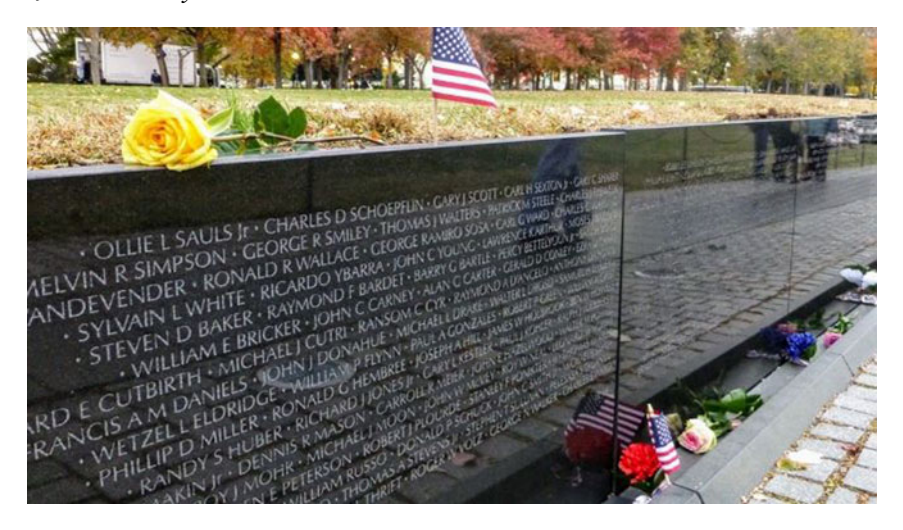
Figure 2. The memorial lists the names of American military personnel killed in the Vietnam War.

In her design statement, Lin described the memorial as "a rift in the earth — a long, polished black stone wall, emerging from and receding into the earth." 5° She wrote, "Walking into the grassy site contained by the walls of this memorial we can barely make out the carved names upon the memorial's walls. These names, seemingly infinite in number, convey the sense of overwhelming numbers, while unifying the individuals into a whole." Lin's words show that she attempted to combine individual and collective planes of memorializing the war dead. The names of the dead do not bear any information about their age, ethnicity, or military rank, as if the designer wanted to emphasize that everyone is equal in the face of death. Lin explained that reading and touching the names on the Wall was supposed to help people mourn the loss of the soldiers — the memorial was not meant to be a representation of individual and collective pain, but rather an object that would enable visitors to experience catharsis and healing (Figure 3).52