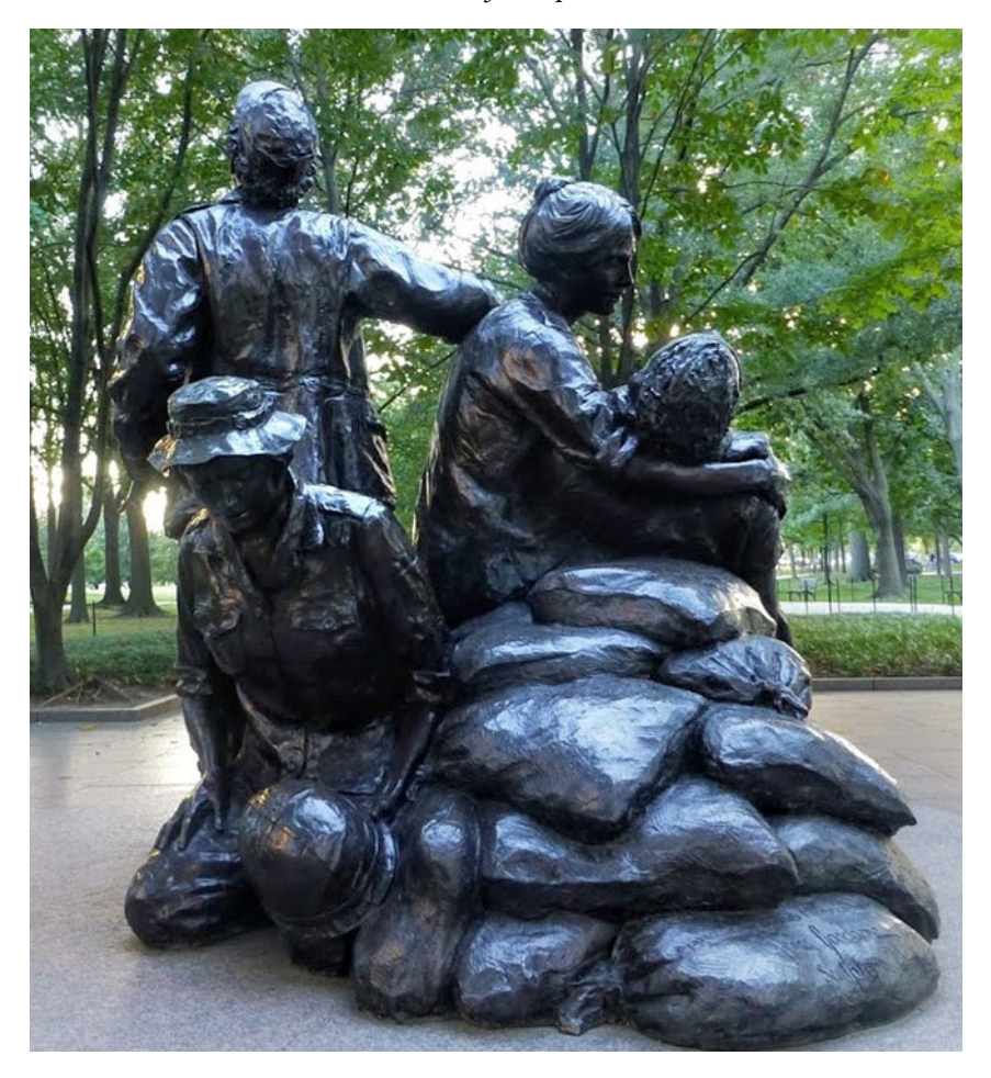
Figure 9. The kneeling figure is thought to commemorate civilian women who participated in the war.

I argue that the message of the VWM can be understood within the tradition of the politics of consolation. This term refers to the existential dimension of American politics which gains special prominence whenever the nation is in crisis.<sup>74</sup> The defining text of the politics of consolation is the Gettysburg Address, delivered by President Abraham Lincoln at the dedication of a military cemetery in Pennsylvania in November 1863.75 A few months earlier, Gettysburg had been the scene of the bloodiest battle of the Civil War.