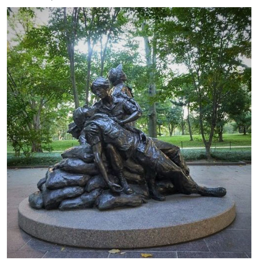
Figure 6. The Vietnam Women's Memorial unveiled in 1993.

covers her face. She holds a helmet, which may belong to the wounded man. She looks depressed; her body language suggests anxiety and helplessness (Figure 9). The women's memorial and the statue The Three Soldiers are similarly realistic, but the VWM is more expressive, depicting more emotional variation. Overall, it is a highly dramatic portrait of war service.