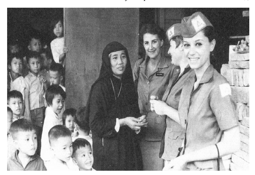
Figure 12. Women and children – another photograph from the VWM's dedication pamphlet (courtesy of the VWMF/Eastern National).

taking care of local children, replacing their parents whose absence – it needs to be noted - is not explained in any manner.