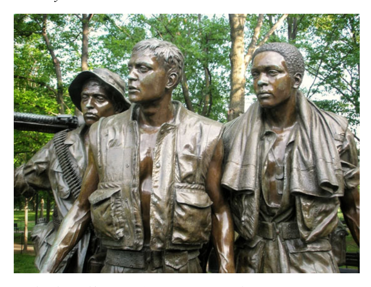
Figure 5. The Three Soldiers - an ethnic representation of American servicemen in Vietnam.

that this person is the most important of the portrayed trio and, by extension, the most important representation of Americans as a nation.