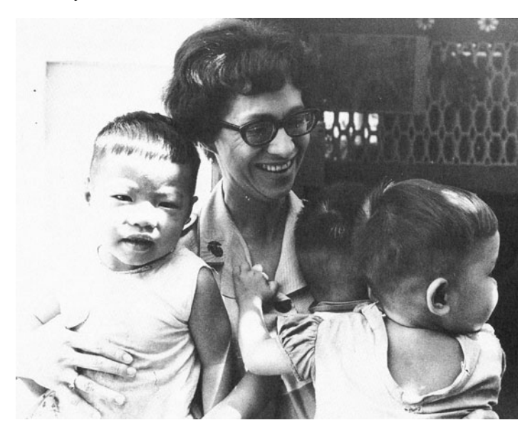
Figure 11. A portrait of a woman Marine holding Vietnamese children included in the pamphlet published for the dedication of the VWM (courtesy of the VWMF/Eastern National).

American attitudes toward Vietnamese people, and Vietnamese women in particular. Only four out of dozens of photographs in the pamphlet feature Vietnamese women. Three of these photographs show Catholic nuns. Two of the nuns' photographs are included in a collage making up the VWMP's promotional poster captioned "Not all women wore love beads in the sixties."120 The first of these photographs portrays a Vietnamese nun in a white habit and a veil who is conversing with an American woman in military garb. The women are standing in front of a building topped with a cross. 121 In the second photograph, a young grinning Vietnamese nun is sitting next to an American military woman who is holding Vietnamese toddlers on her lap. 122 In the center of another photograph included in the pamphlet - which illustrates an article about civilian women who served in Vietnam-there is a smiling Vietnamese nun surrounded by several American women dressed in Army Special Services uniforms and a group of Vietnamese children (Figure 12).123 The message of these photographs is uniformly positive. It suggests friendly cooperation between American and Vietnamese women in