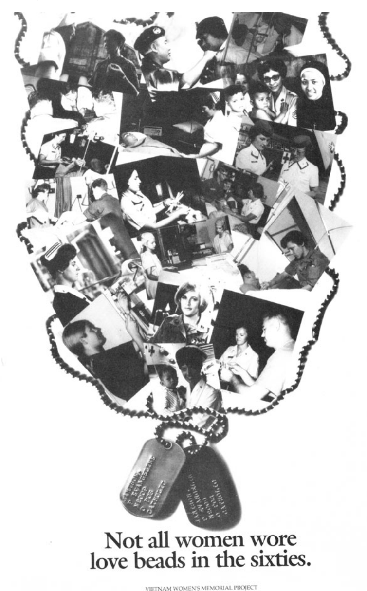
Figure 10. The VWMP's promotional poster (courtesy of the VWMF/Eastern National).

The poster suggests that, unlike such unpatriotic youth, "Vietnam women" were dedicated to the service of their country and countrymen, and not afraid to put their lives on the line. This may indicate that the VWMP attempted to garner support for the women's memorial by weaving its