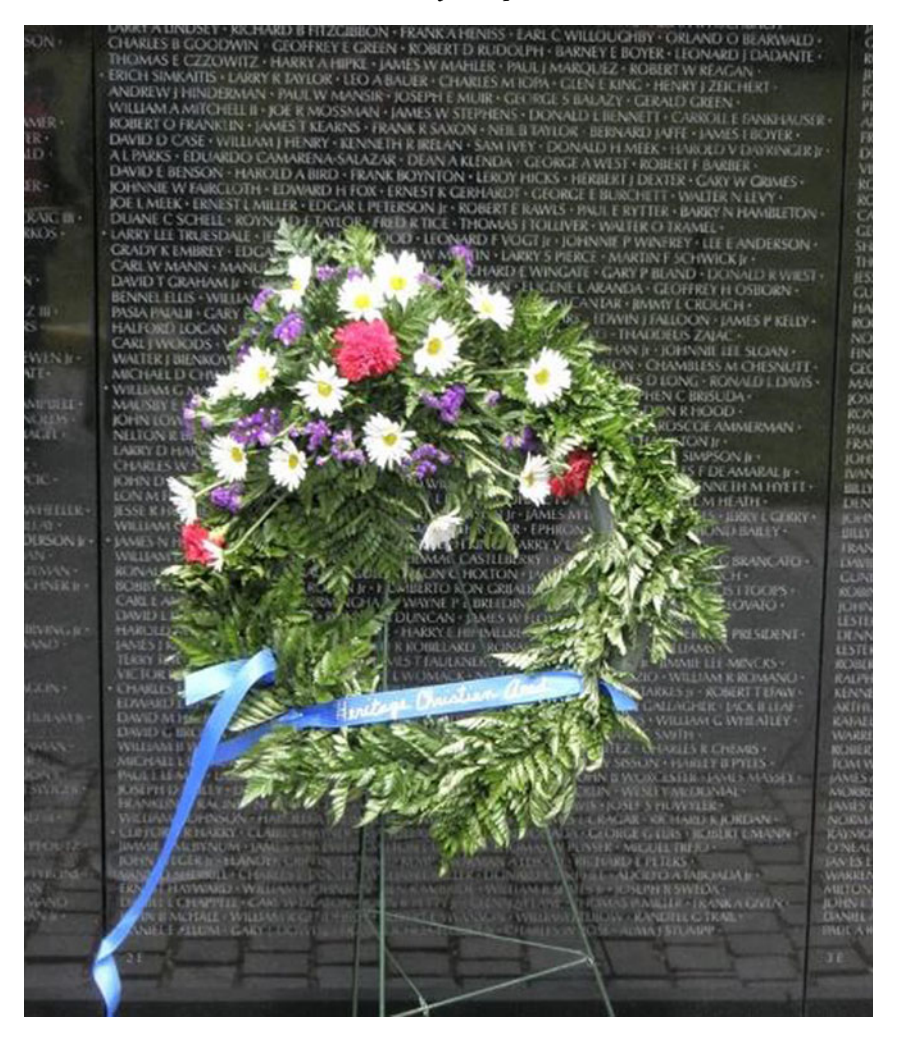
Figure 3. A tribute to the fallen – a wreath left by visitors to the Wall.

veteran, started articulating competing commemorative claims. They criticized the memorial's color and shape, as well as its underground location. In the most serious critique, Carhart called the memorial "the black gash of shame."53 He regarded the Wall as an anti-memorial which expressed an aversion to the US military effort in Vietnam and did not show proper respect to the soldiers who participated in the war. Carhart believed that the memorial's design