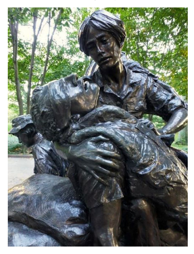
Figure 7. The central figure of the women's memorial – a nurse taking care of a wounded soldier.

century – has the shape of a triangle extending downwards. Its apex is marked by the Virgin Mary's head and its base is formed by her robes. In the case of the VWM, the base of the composition is formed by sandbags. The dying soldier is the memorial's protagonist. His suffering is reflected in the compassion of the woman who holds him, the vigilance of the standing woman, and the sadness of the kneeling woman. The monument thus portrays women as nurturers, consolers, and mourners. Looking at the VWM one may conclude that men's sacrifice legitimized women's participation in the war – i.e. women participated in the war because of and for the men-and made them worthy of national commemoration. Tellingly, the designer of The Three Soldiers, who attempted to portray the soldiers' diversity in terms of their race and ethnicity, did not think it necessary to depict the gender diversity of those who served in Vietnam. This might suggest that both in wartime and in Washington's public spaces, women were marginalized to the point of being invisible. It is also worth noting that the central figure of both The Three Soldiers and the women's memorial is a white male. All other figures seem secondary to him. This white soldier, who is exhausted and confused