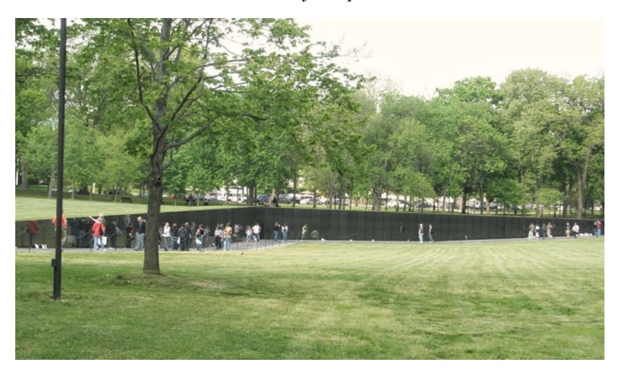
Figure 1. The Vietnam Veterans Memorial (the Wall) in Washington, DC (photograph by the author).

CFA quotes the words of Paul Spreiregen, an architect commissioned by the VVMF, who said that "consideration had to be given to the fact that it [the VVM] was a memorial to servicemen and women in a war that was lost and a war for a cause that will remain a question."47 This makes it clear that, despite the VVMF's proclaimed "agnosticism over the war," 48 its representatives held strong opinions about it. They revealed them behind a federal commission's closed doors but were reluctant to share them with the public. As I will show, the VVMF's privately conflicted approach to commemoration resulted in public disagreements and the addition of new elements to the memorial's site.