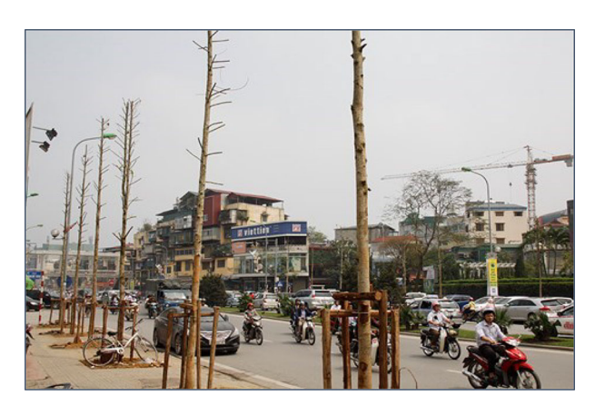
Fig. 3 Trees replanted in Nguyen Chi Thanh street after all big old trees in this street were chopped down.

fact Magnolia conifera , <sup>1</sup> a deciduous tree native to China which grows up to 30 m in height, and it is among species that are not recommended to be planted in urban streets (Thanh Nien News 2015). As quickly as within just a few days, Hanoi looked like a construction site with loads of large healthy trees being cut into logs and spread on the ground. Within a very short period of time, as many as 2000 trees which included a large number of old and valuable trees were completely cut down.