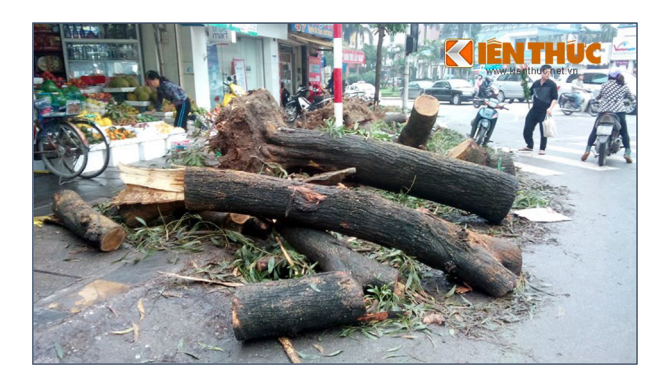
Fig. 2 Healthy old trees were chopped down. Hanoi looked like a construction site. Source http://www.kienthuc.net.vn. Available at http://www.kienthuc.net.vn/soi-xet/ha-noi-xin-khat-hang-loat-cau-hoi-vu-chat-cay-xanh-468493.html

than being chopped down. It is heart-breaking. How many years do we have to wait to have shade from trees again, which is really needed in this city where thousands of street vendors and labourers are every single day grappling with the heat in burning summers? (Interview, 18 March, 2016, Hanoi).