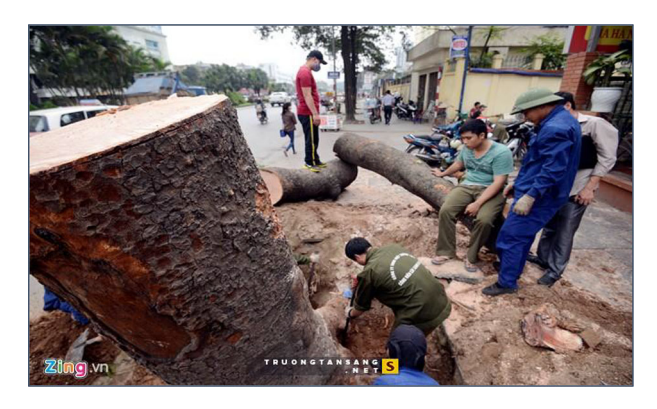
Fig. 1 Healthy old trees were chopped down. Hanoi looked like a construction site.