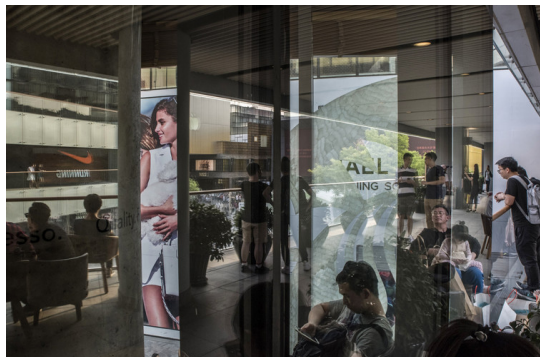
China's meteoric rise in prosperity has instilled confidence in many Chinese, especially younger ones who have only experienced good times.

emerged from poverty and how well its economy compares with others.