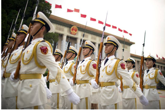
Members of a Chinese honor guard line up in formation at the Great Hall of the People in Beijing.

Once-reticent citizens now see their country as ascendant—and America in decline