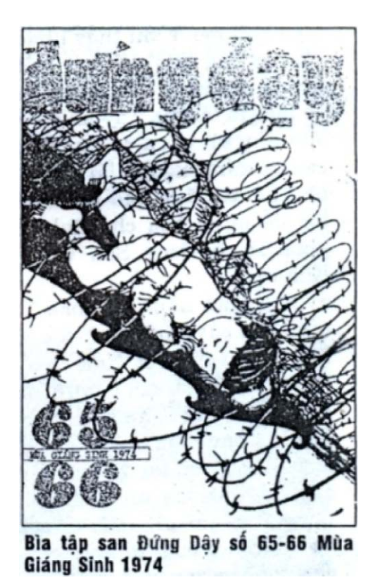
FIGURE 5: The cover of Đứng Đậy [Stand Up].<sup>128</sup>

exploited anymore, then they rise up and take to the streets." Trinh Công Sơn uses the image of ripe fruit to suggest the end of the current regime is near: